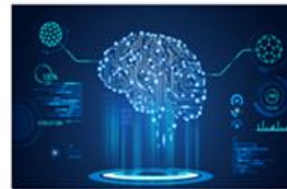
Data Science & Machine Learning