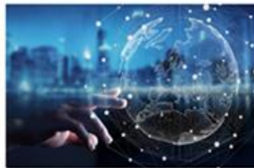
Center of Excellence - Setup