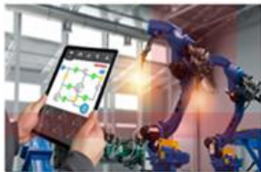
IOT Edge Device Development

Our team is highly experienced in Edge Device Development, Production Analytics, Smart Connected Operations for factories and Aftermarket Intelligence & Customer Experience. Our proficient team is skilled in choosing the right Sensors, Actuators and devices to communicate and analyze real-time data to provide intelligent solutions.